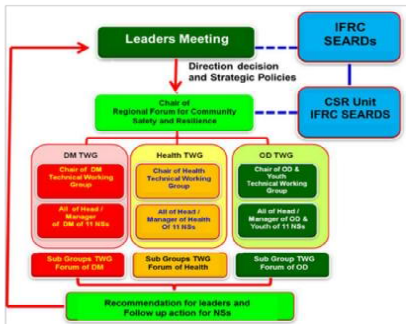
Figure 1- Flow of Communications and Coordination