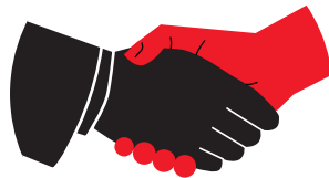
Community driven programmes and community engagement