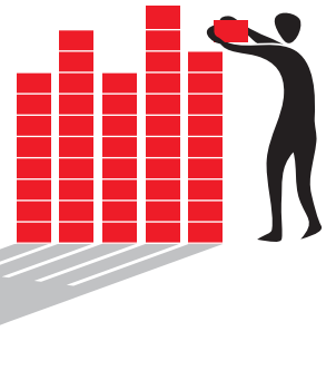
Data analysis and improved programme delivery