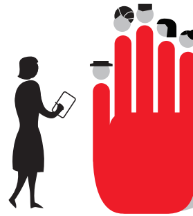
Dialogue with the community