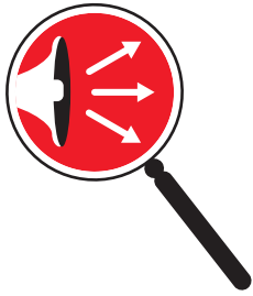
Baseline consultation on communication channels