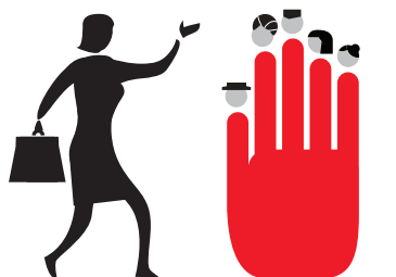
Evidence base for humanitarian diplomacy