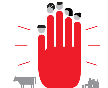
More resilient communities