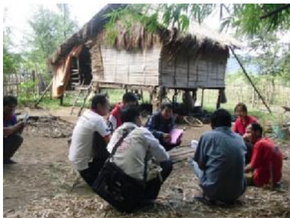
Lao Red Cross conducting post-distribution assessment with beneficiaries in Salavan Province, Laos

With facilitation by IFRC, the Thai Red Cross offered the staff on loan (SoL) to support implementation of DREF operation, two Thai Red Cross Representatives were part of the workshop in order to understand the effectiveness of SoL role as well as to share their experiences in order to strengthen peer learning and explore opportunities to continued cooperation between two national societies.