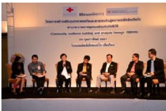
EWEA Training: Panel discussion among representatives of the Thai Red Cross (HQ & Branch), local community, local government and IFRC, Chiang Mai, February 2014.

The focus of EWEA training was on all focal points / “Mr Warners” from 5 provinces: Ubonratchathani (5 people), Petchaboon (5 people), Chiang Mai (5 people), Burirum (3 people) and Surin (2 people) provinces.