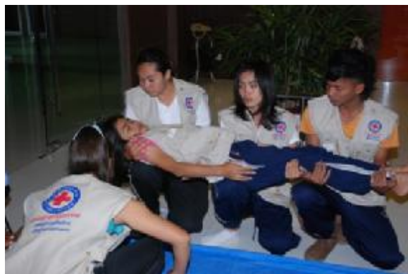
Thai Red Cross Youth and Volunteers attending a seminar on sustainable First Aid, 22-23 February 2014.

Website for Emergency Operation Centre (EOC) is finalized and manual has already been prepared. The website will be used as a centre for sharing and exchanging information's for the command in case of natural disasters and other emergency situation. Orientation training on EoC website was organized for related staff members during 6-7 February 2014.