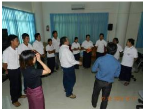
Debriefing after simulation exercise with MRCS staff and volunteers

MoH also highlighted important diseases that can cause epidemics in Myanmar and how MRCS can play a vital role in all phases of the epidemic response cycle and assist the government to decrease epidemic related morbidity and mortality.