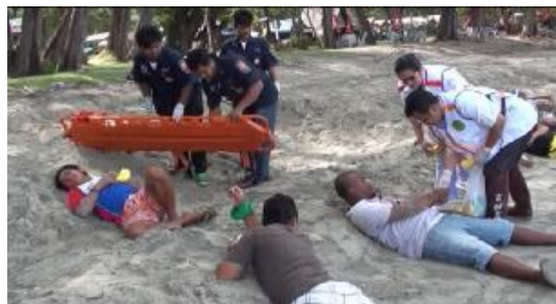
Simulation Exercises run by Trang Provincial Red Cross Chapter – Thai Red Cross

The simulation exercise showed that Trang Provincial Red Cross Chapter understands the standard operating procedures for disaster response and could perform their mission accordingly. However, they have learned that there are areas that they need to improve for better response operation. IFRC will look into possibility to support newly identify challenges and provide adequate response/support.