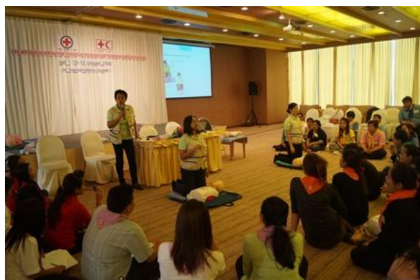
First aid demonstration and Q & A session run by The Thai Red Cross trainers from Youth Bureau

The level of institutional disaster response preparedness of TRCS has also been satisfactorily increased.