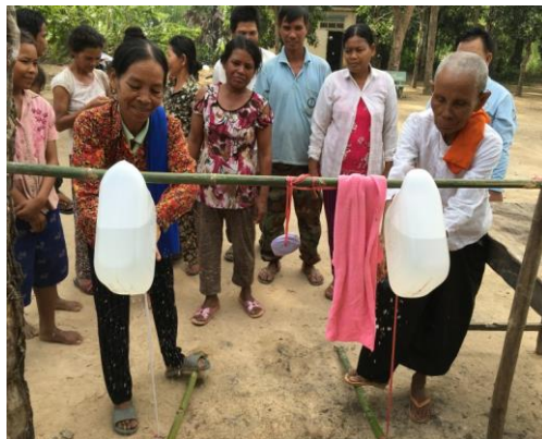
Svay Rieng Branch volunteers provided training on hand washing with soap and community practicing hand washing at Toul sdey village

After completion of PHAST training, the volunteer organised the Hand washing session with soap to community and trained community for construction of Tippy tap.