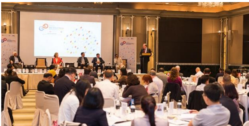
Welcoming remarks from the representatives of co-organizing partners

The workshop program revolved around the following four themes: Enhancing Community Resilience; Expanding Preparedness for Response; Innovation and Risk-Informed Development; and Mainstreaming DRR Within and Across Sectors - Focusing on Agriculture and Resilient Livelihoods.