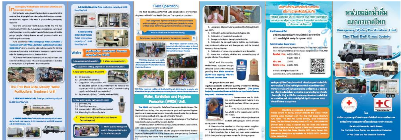
IEC Materials (brochure) on water purification unit

Relief and Community Health Bureau developed and printed 20,000 copies of brochures (in Thai and English) as a tool to raise awareness for Thai Red Cross humanitarian and disaster relief operation services specifically “Emergency Water Purification Unit” and “Water, Sanitation, and Hygiene Promotion (WASH) Unit” RCHB plans to distribute the brochure to Thai RC offices, local governments, and community members.