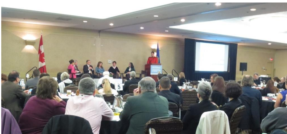
Canadian Red Cross representative participating in a panel discussion entitled “Disaster Risk Reduction is Everyone’s Business” as part of Canadian National Platform.

Platforms, humanitarian diplomacy and beneficiary communications, disaster law as well as gender and diversity. The conversation will continue early 2016 as part of the annual planning under the RRI.