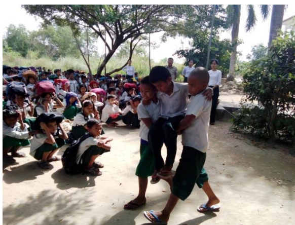
School drill exercise