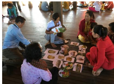
PHAST training at household /community level for step 4