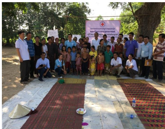
PHAST Training at household level by Svay Rieng volunteers

On 21 November, 2015 at Toul Sdey village toul sdey commune, Cambodian Red Cross –Svay Rieng branch volunteers conducted PHAST training to villagers on step 4 activity 4.1 and 4.2. The session was attended approximately 40 Households and RCV provided training in groups of 4-5 households.