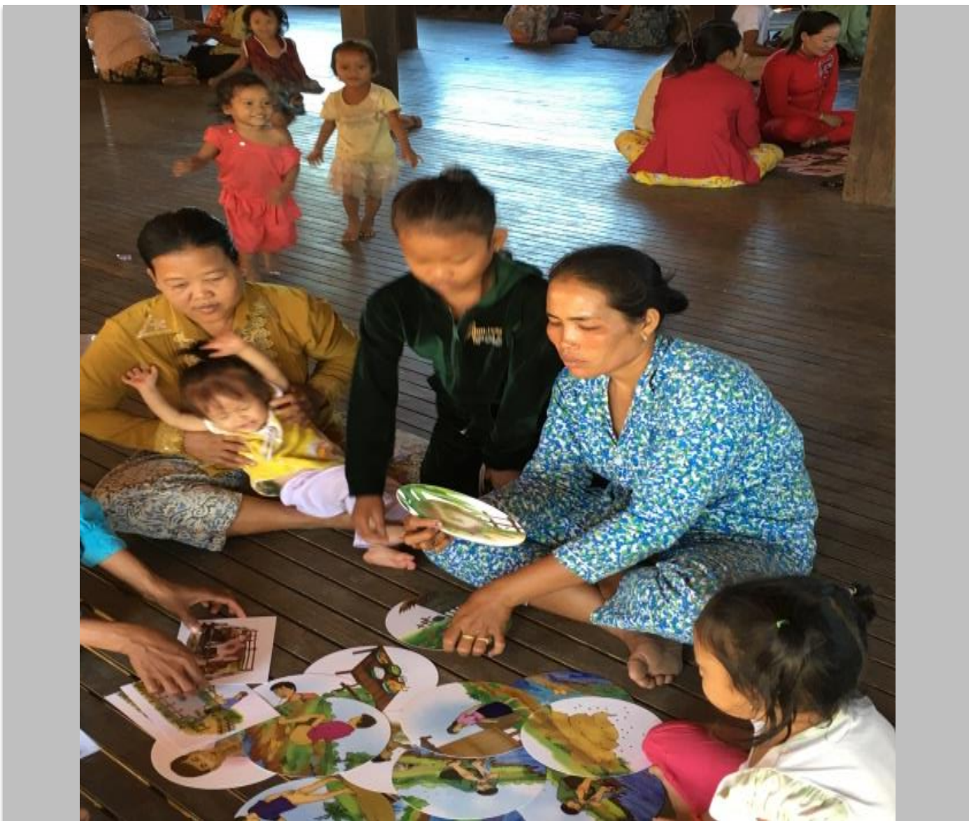
Participatory hygiene and sanitation transformation (PHAST) training at household level by Cambodian Red Cross volunteers in Kratie province