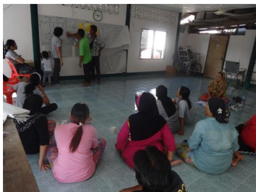
Assessing the disaster risk to the community and brain storming for disaster preparedness and response plan