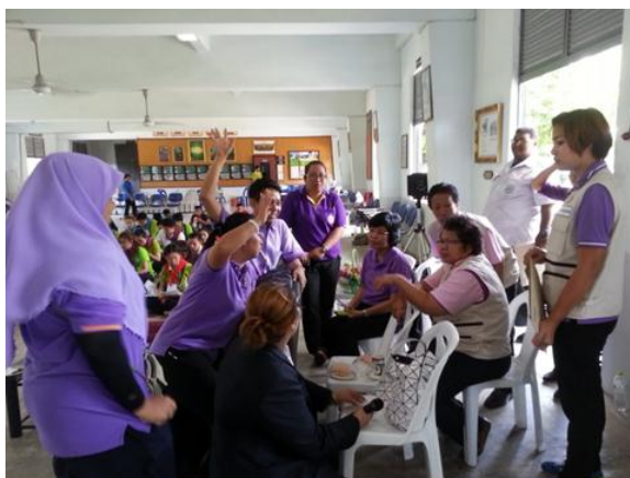
CPR and choking training for youth network