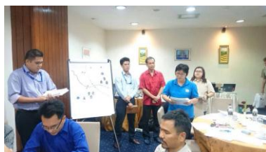
Thai Red Cross