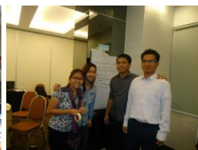
Philippine Red Cross