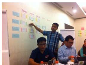
Lao Red Cross