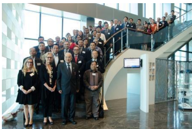
Forum group photo