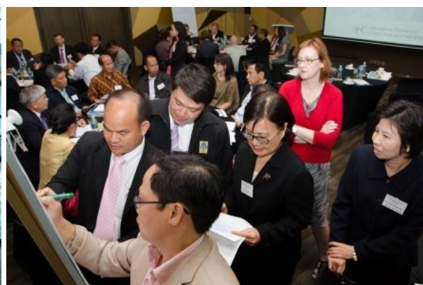
Group session: Thai Red Cross and Thai NDMO

On 10-11 June, over 60 representatives gathered in Bangkok at the ' Regional Disaster Law Forum for Southeast Asia '. These included National Society leaders and technical staff, NDMOs, ministries of foreign affairs, parliamentarians, United Nations organizations, NGOs and the ASEAN secretariat. The Forum discussed disaster law developments at the national, regional and international levels. This included a 'stocktaking' of national disaster law developments (including where states and national societies have worked together to develop or review disaster management laws and regulations); enhancing engagement with ASEAN and preparation for the post-2015 AADMER work programme; developing a regional disaster law advisory group; and discussion of key disaster law themes and pledges coming before the 32 nd International Conference of the Red Cross Red Crescent in December 2015.