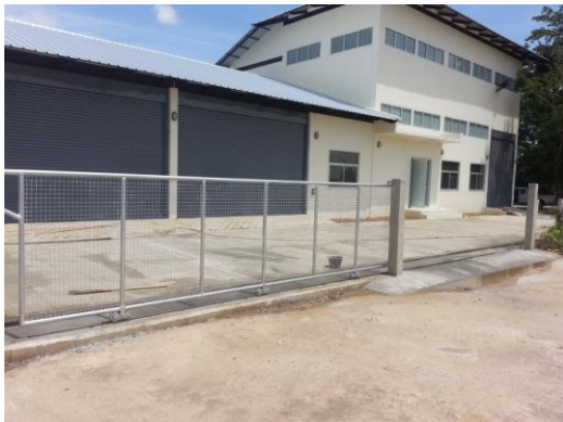
Platform to the Warehouse

The project has been completed and handed over on 17 June 2015.