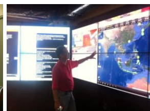
Vietnam Red Cross