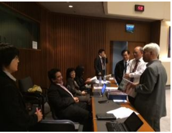
Opening of the conference