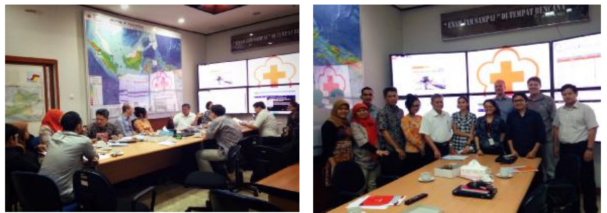
PMI meeting on RRI planning (DM, Health, OD, Communications, training unit, and planning bureau, with IFRC country delegation colleagues)

Government). Feedback will be provided to each National Society in March, with in some cases a need for further clarification to be provided on the proposed activities.