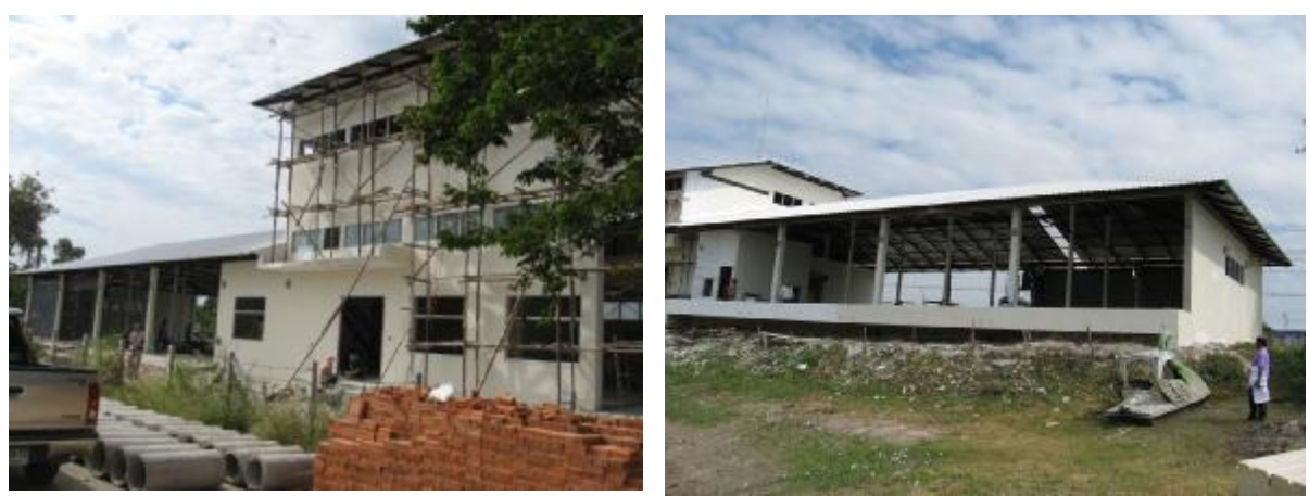
Warehouse/storage location for water purification units and flat-bottomed boats