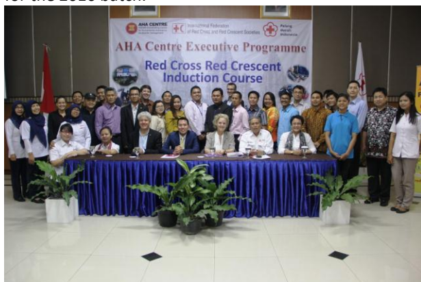
Group photo after opening session

AHA Centre will be evaluating the overall ACE Programme early August with participants and a meeting will be held in Bangkok at the end of August with partners (UNOCHA, WFP, IFRC, UNDP, DHL, etc.) to feedback and plan ahead for the 2016 batch.