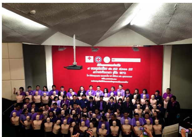
Group photo after the distribution of dummies