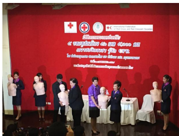
CPR dummy distribution (one dummy per district)