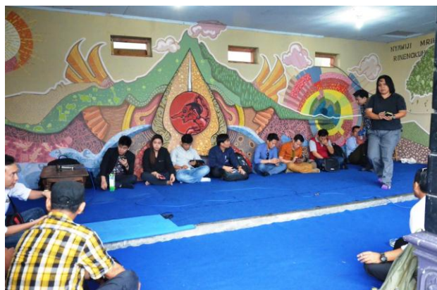
Meeting with communities around the Merapi volcano in a community centre with a painting showing traditional / indigenous knowledge about the volcano.