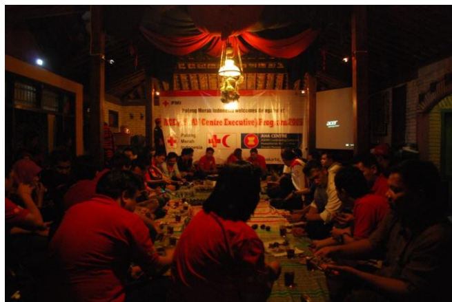
Meeting with communities in a traditional Javanese house with CBAT (Community Based Action Team) members.