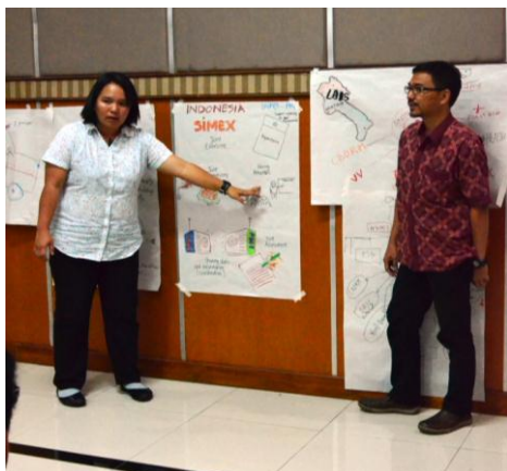
Group work in which each country presents in a poster how they see their National Society. In the photos, the representatives from Indonesia (BNPB = NDMO) present PMI.