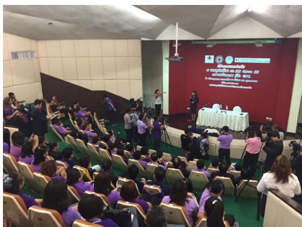
Opening of the event