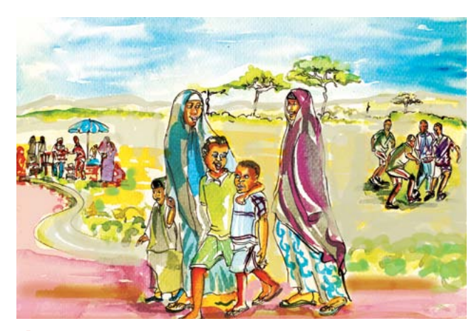
Everyone deserves to be safe from violence