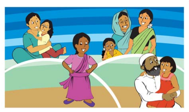
பெண்குழந்தைகள் ஆண் குழந்தைகளைப் போலவே மதிக்கத் தகுதியுடையவர்கள்