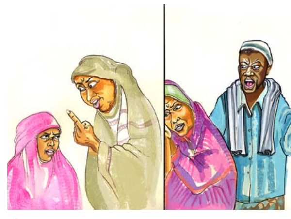
4 Crushing a person's self-esteem is damaging and unhealthy