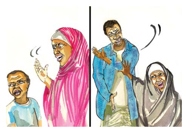
2 Hitting other people is harmful and unnecessary