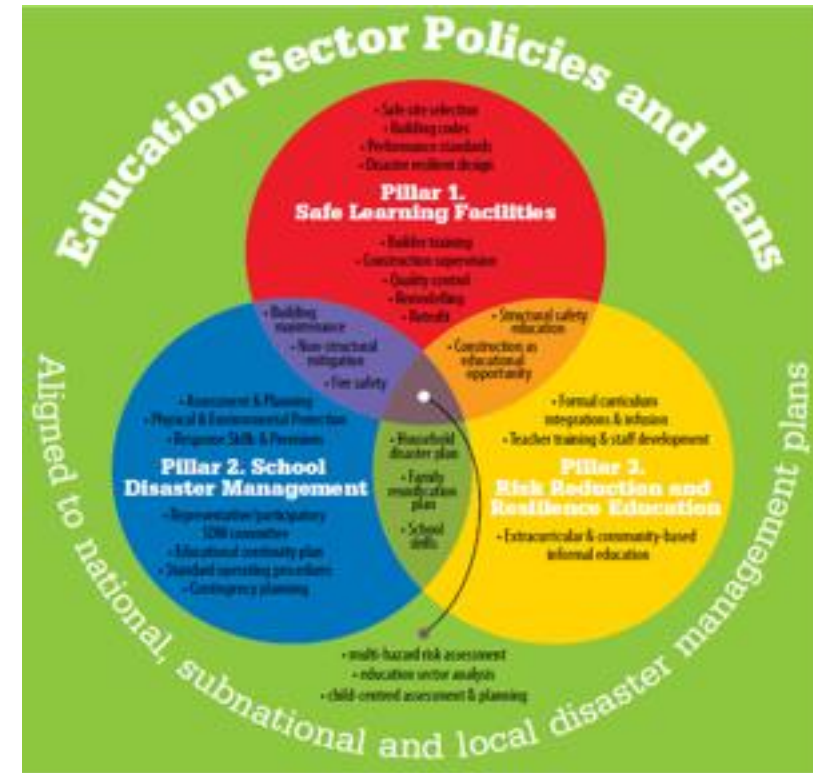
Comprehensive School Safety Framework