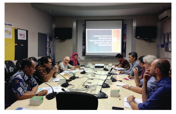
PMI and IFRC have been working closely with the NDMO (BNPB), the UN and other partners to promote IDRL and revise existing DM guidelines in Indonesia.