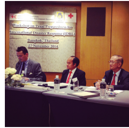
Thai Red Cross held a national IDRL workshop in November 2014, together with IFRC, the Department for Disaster Prevention and Mitigation (DDPM), and UN OCHA.