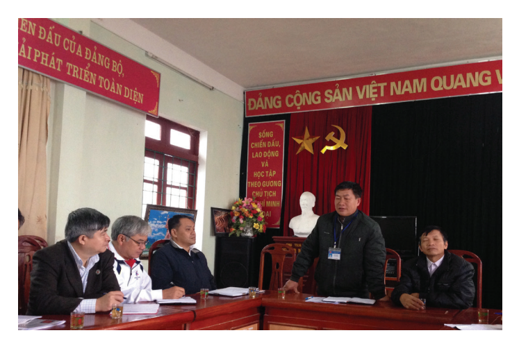
National Societies and governments in Lao PDR and Vietnam participated in a study exchange tour to discuss the development of their national disaster management laws.