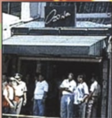
Many victims died trying to exit the Ozone disco.

On August 18, 2001, a fire accident happened in Manor Hotel in Quezon City, killing 75 guests and wounding 52 others. The victims, mostly local guests from various evangelical churches of the Don Clowers Ministry, a Texas-based Christian evangelical group, were asleep when the fire struck. They were trapped inside their rooms because the hotel's fire exit was blocked.