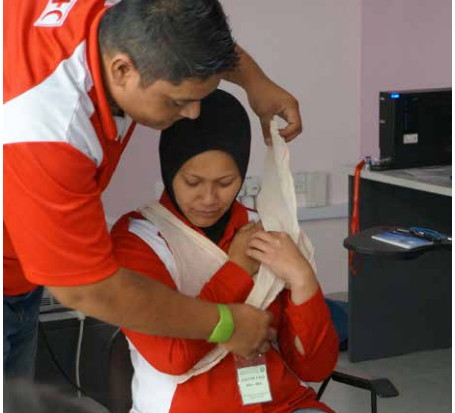
First aid activities by Brunei Red Crescent.

beneficiaries supported in 2014 11 in Asia Pacific 12