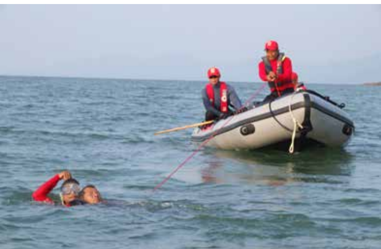
Preparedness is key to protection and resilience. Here Thai Red Cross practice 'sea search and rescue'.