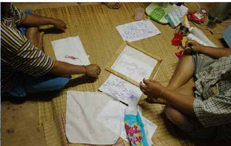
In engaging children and young people fleeing their homes, the Red Cross Red Crescent promotes a culture of empowering children and youth to take meaningful action and giving back to the communities.

“Today, the woeful plight of migrants, particularly the millions of women working as household service workers who are most vulnerable to abuse, maltreatment and other violations, compel the Red Cross Red Crescent Movement to focus on the issue”