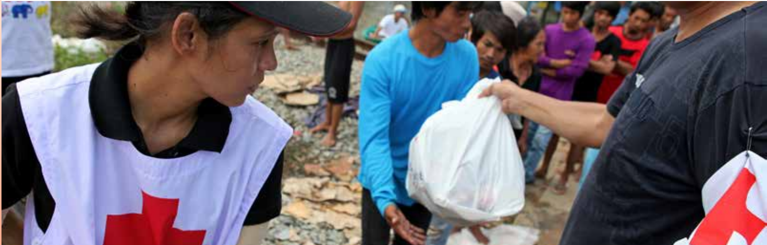
Thai Red Cross helps migrant workers during the Thai Floods of 2011.