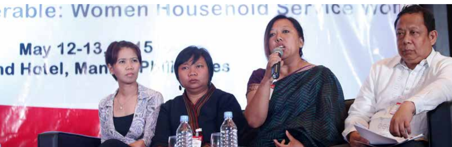
The Manila Conference on Labor Migration.