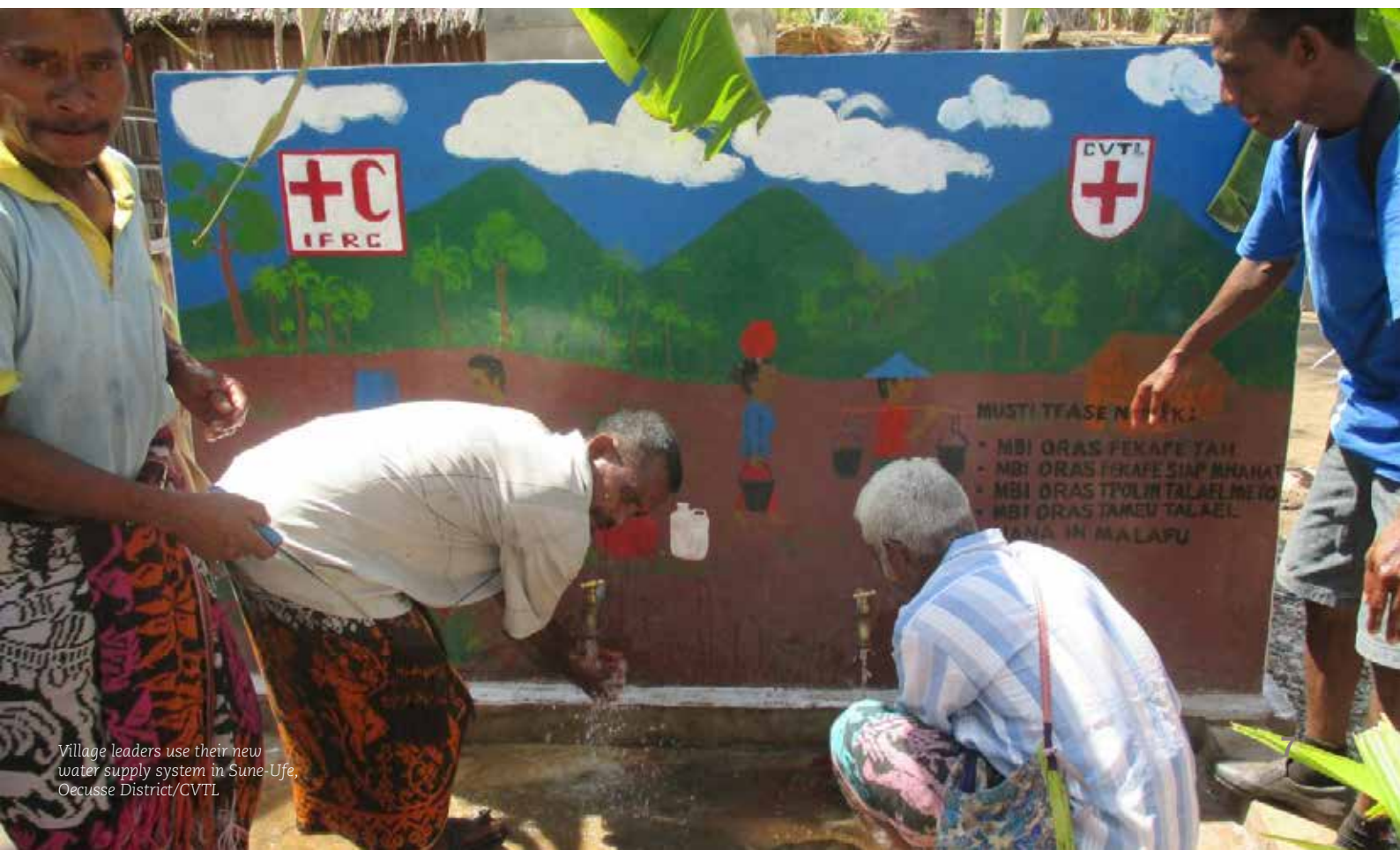
Village leaders use their new water supply system in Sune-Ufe, Oecusse District/CVTL

The Community Based Health and First Aid (CBHFA) program, developed the capacity of community volunteers through training and workshops. These sessions concentrated on basic health and hygiene awareness that go hand in hand with safe access to water and sanitation. Hand washing, boiling of water and proper food preparation practices eliminates the risk of diarrhea, especially among children under five. Developing practical First Aid skills tailored to specific communities and the local environment following a vulnerability capacity assessment is also a key component of the program. These groups, equipped with knowledge and skills, are tasked with the dissemination of information that will increase understanding, awareness and result in changing behavior within their respective communities. Over the last five years this knowledge sharing has reached 28,024 vulnerable people and CVTL has distributed more than 1,500 first aid kits.