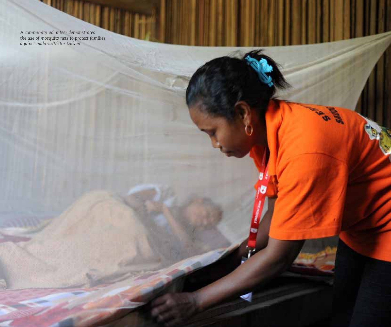
A community volunteer demonstrates the use of mosquito nets to protect families against malaria

To combat high rates of malnutrition, CVTL conducted a nutritional educational program, with a special focus on maternal and children under-five. Working predominantly with women as the primary family caregiver, trained staff advised on nutritional, balanced diets that were designed around locally available foods and within the framework of the pre-existing family food budget. New mothers were given educational material around the value of breast-feeding and the benefit it has over formula powders that have become increasingly relied upon. Staff demonstrated good breast-feeding techniques and instruction for nutritional food preparation after the recommended breast-feeding period of six months. All training sessions concluded with a cooking demonstration using a wood stove, which has the additional health and cost benefits of decreased smoke inhalation and lower consumption of wood, compared to the widely used open fire. In total more 1,100 mothers attended these sessions increasing their awareness around nutrition and providing practical solutions to improve the health of their family.