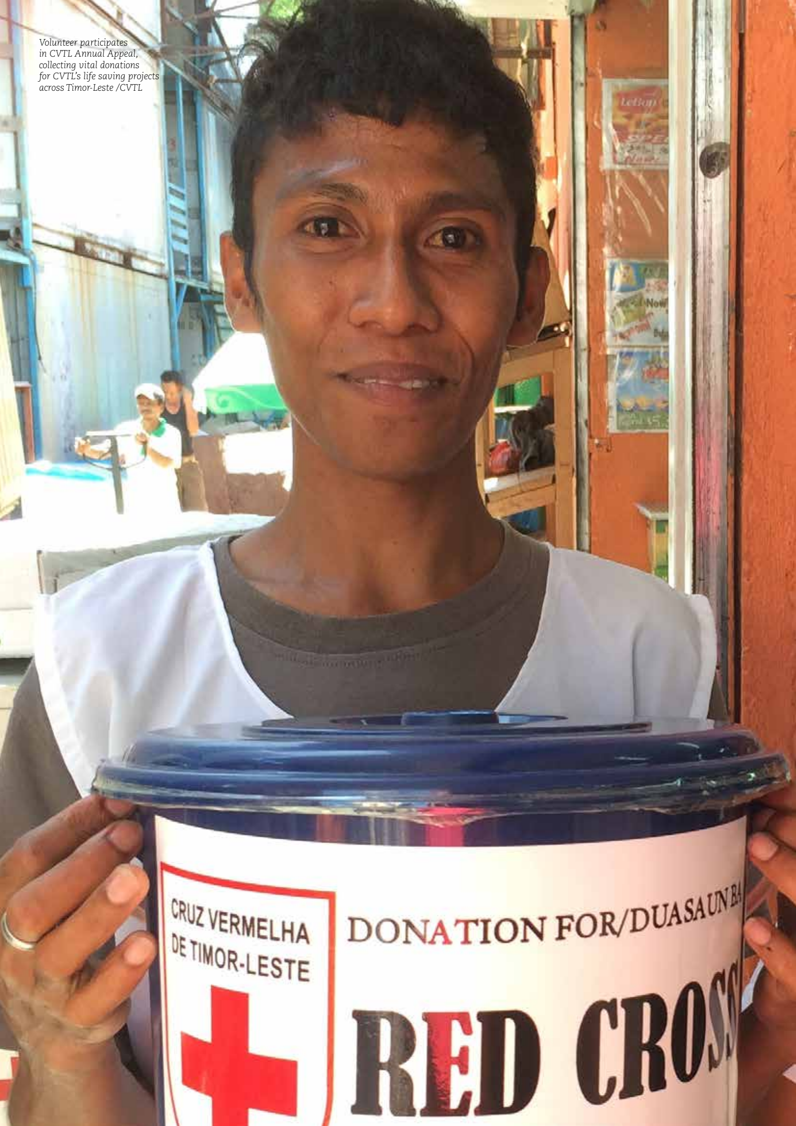
Volunteer participates in CVTL Annual Appeal, collecting vital donations for CVTL's life saving projects across Timor-Leste