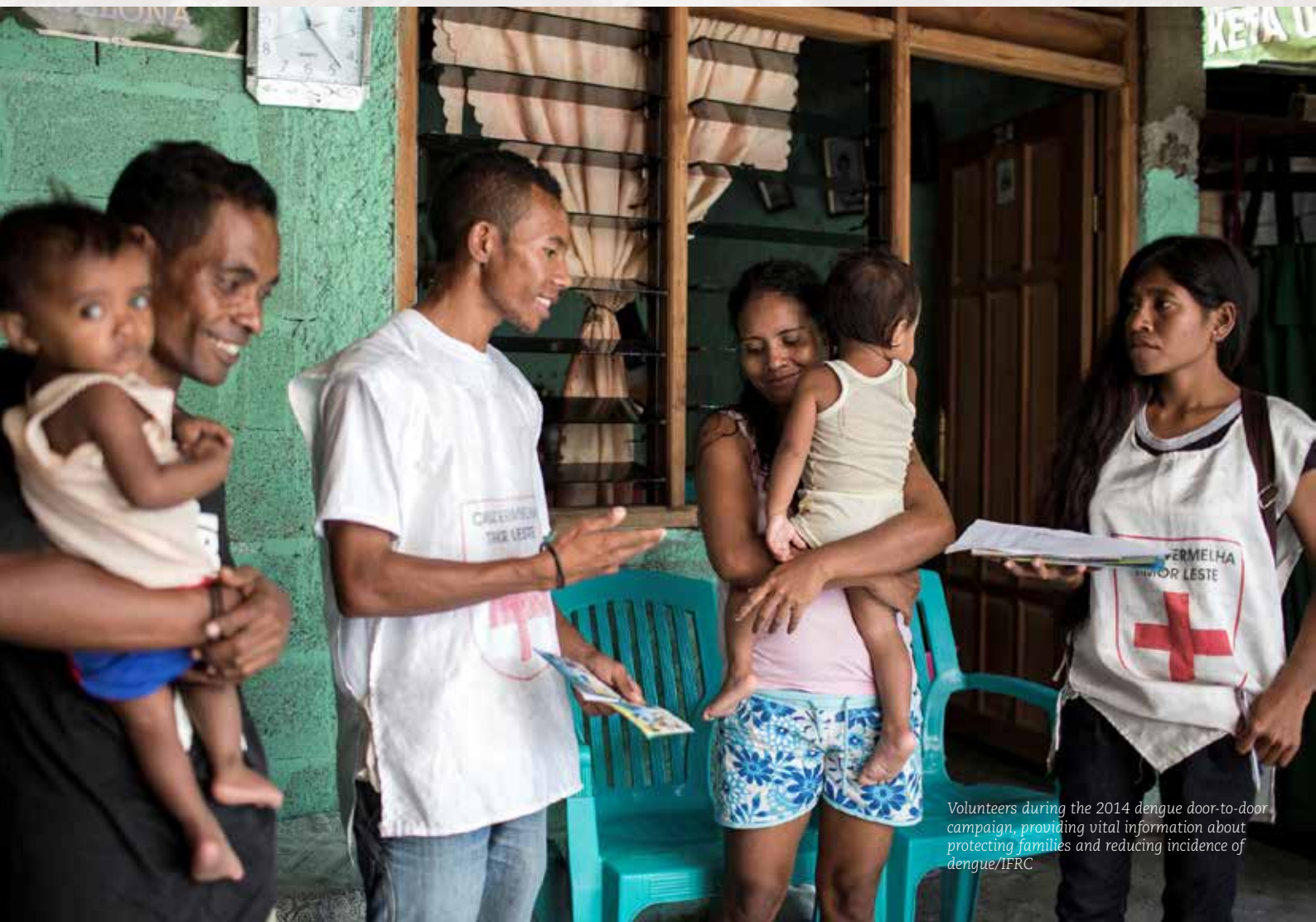
Volunteers during the 2014 dengue door-to-door campaign, providing vital information about protecting families and reducing incidence of dengue

is to abide by humanitarian values and the spirit of volunteerism to alleviate the suffering of the socially-excluded and economically- marginalised, by promoting their health and socio-economic development and enhancing their capacity to prepare for and respond to disasters.