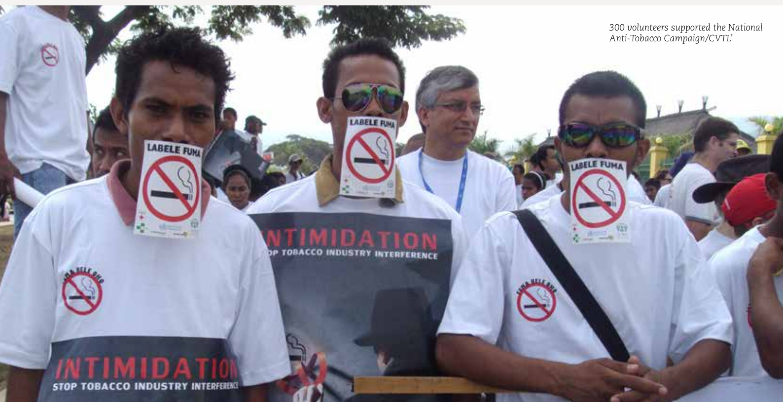
300 volunteers supported the National Anti-Tobacco Campaign/CVTL'