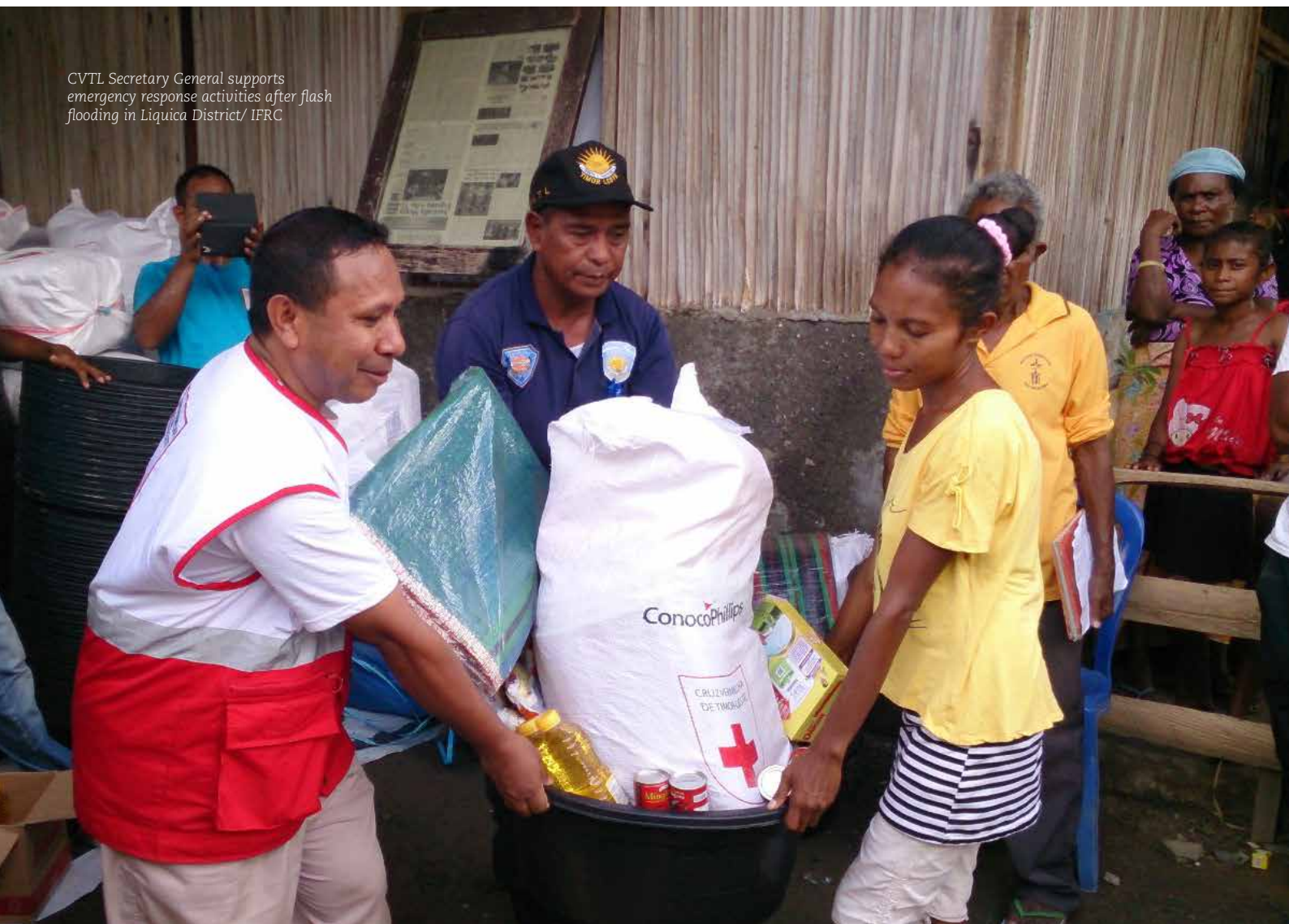
CVTL Secretary General supports emergency response activities after flash flooding in Liquica District

In the five years to 2014, CVTL provided natural disaster emergency response in all 13 districts of Timor-Leste, assisting 17,600 people. Whilst most disaster events during this period were of a small to medium-scale and localised in nature, CVTL maintains their national and branch response capacity to respond to all-levels of disasters through their National Disaster Response Team (NDRT) and Branch Disaster Response Teams (BDRTs). CVTL conducts regular NDRT and BDRT trainings to ensure the readiness of 350 trained staff and volunteers. CVTL's NDRT and BDRTs responded to a severe flooding that occurred in 2013 and affected 27,000 people in seven districts, following from which CVTL supported the community of Suai Loro with a nine-month recovery program.