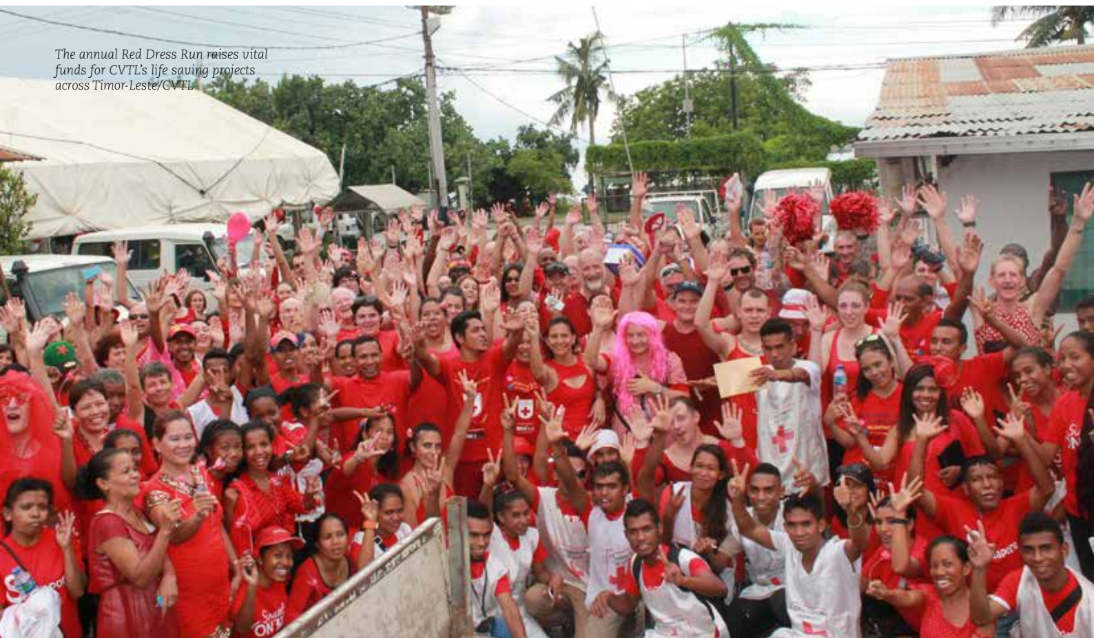
The annual Red Dress Run raises vital funds for CVTL's life saving projects across Timor-Leste/CVTL

Since 2013 CVTL has adapted its approach to take full advantage of emerging digital and online mediums to disseminate information, promote the national society and present its message. An official Cruz Vermelha de Timor-Leste Facebook page has been established, is frequently updated with CVTL's activities, and provides the main vehicle to share information publically due to the platform's popularity and reach to both domestic and international audiences. The current website is currently undergoing a remodification to showcase CVTL's work throughout Timor-Leste over the last 14 years.