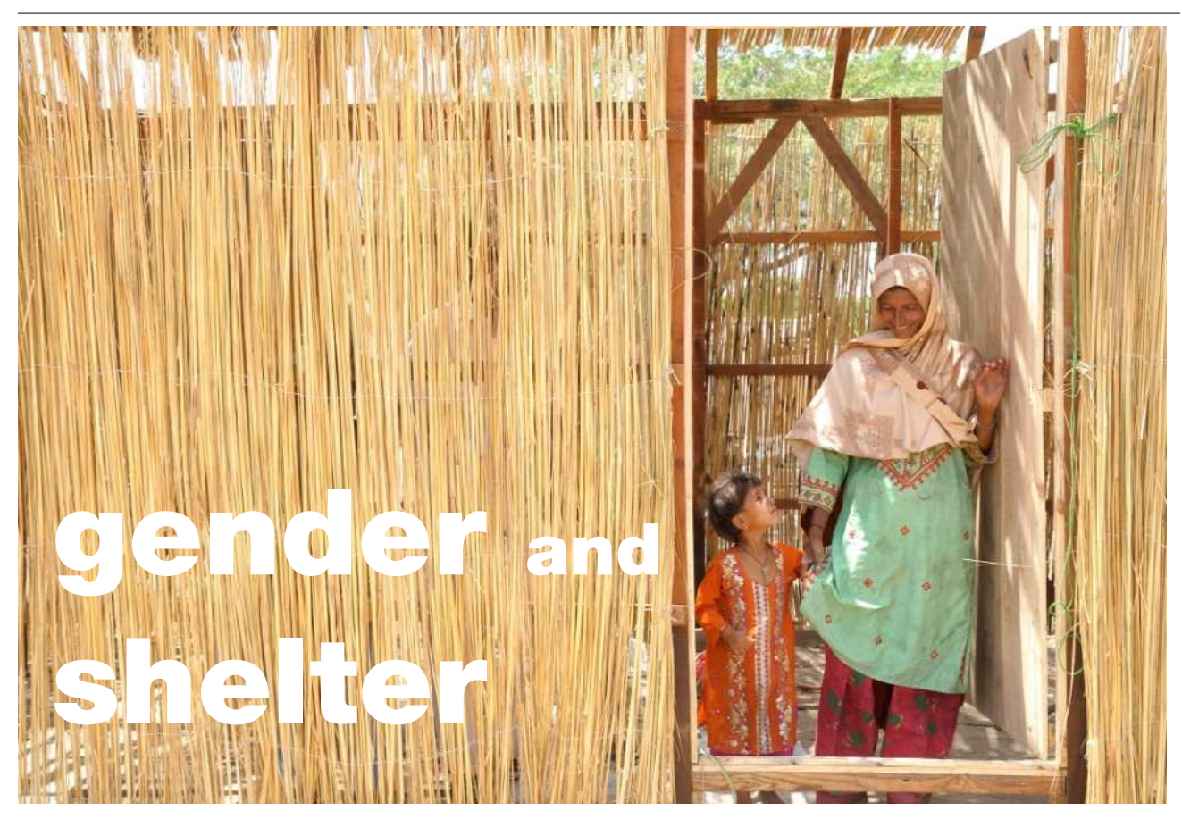
Kualsoom Bibi and her daughter in their new home, being built following the 2010 floods in Pakistan.