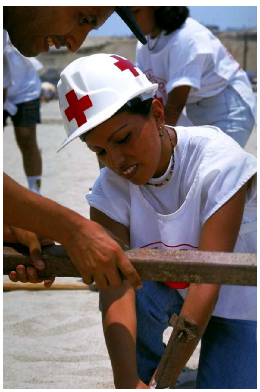
Both men and women should be recruited as staff and volunteers.

Sometimes it can be useful to use an experienced gender trainer to help develop a tailored training program and/or to modify existing materials.