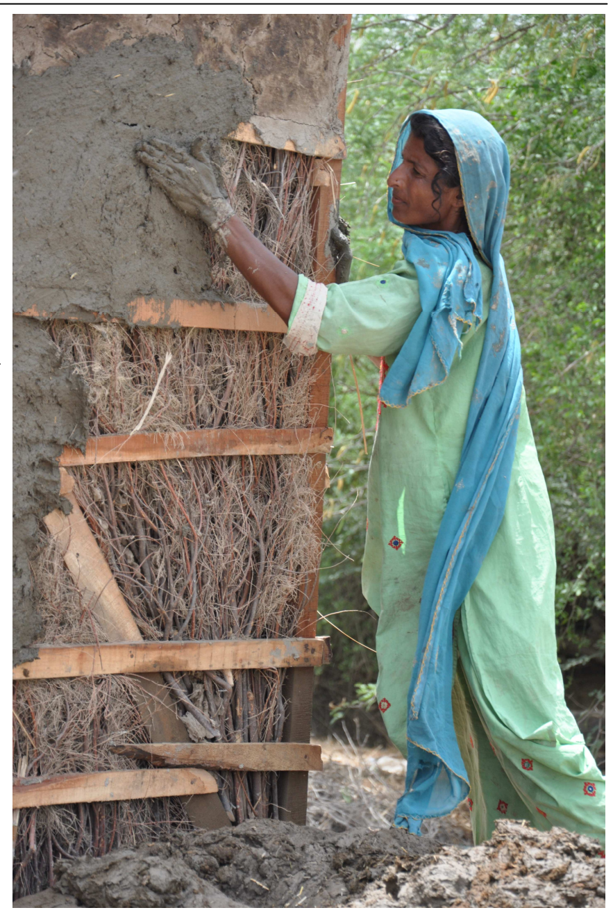
A woman helps construct her home following the 2010 Pakistan floods.

an international border or disputed area can expose young men and boys to criminality, recruitment to and/or exploitation by militia or paramilitary forces.