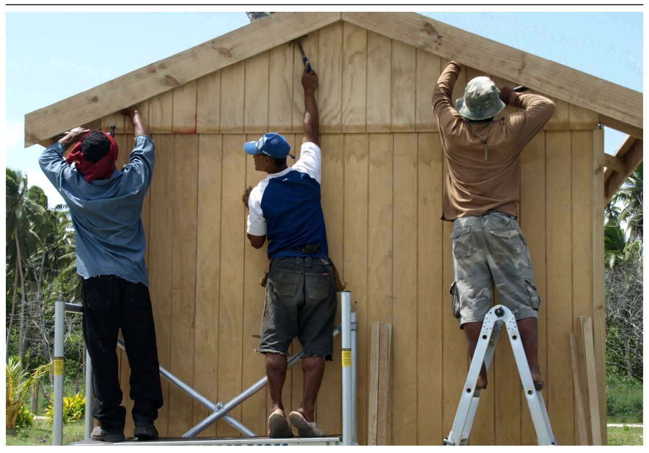
Transitional houses are built in Tonga following the 2009 tsunami.

• Studies have shown that understanding differing gender needs, roles, cultural norms and capacities can assist planners in designing programs that are both feasible and targeted toward those most vulnerable, and therefore more likely to improve the lives of the affected populations.