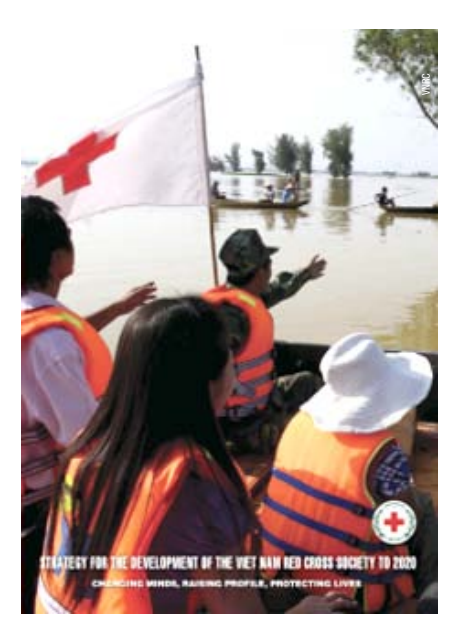
The Strategy for the Development of the VNRC to 2020.