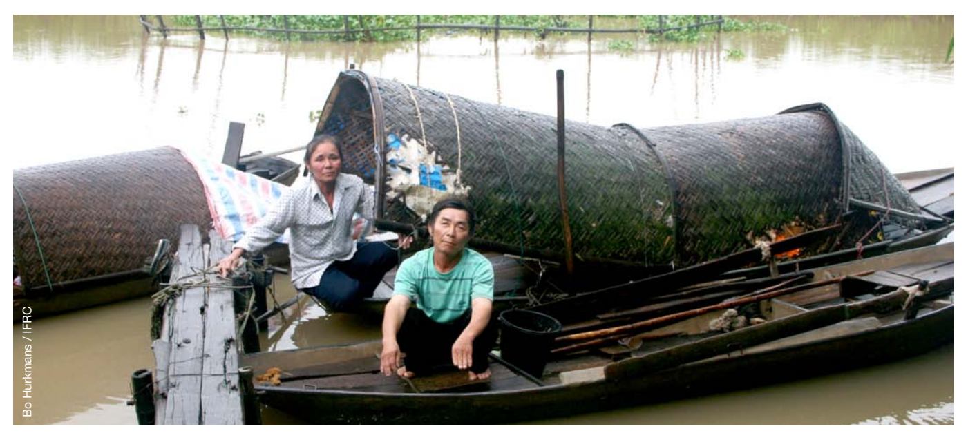
Beneficiaries in Hung Loi Commune (Hung Nguyen District, Nghe An Province) who bought fishing nets with their cash grants after the double floods in 2010.